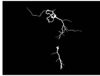
Fig. 3 Threshold : 225~255