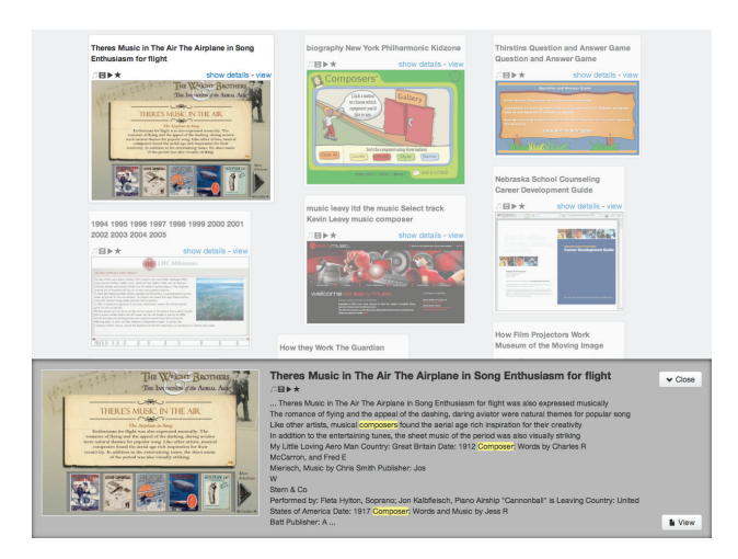
Figure 4: Details view of search 'composer'

in the text are highlighted so that the user sees them in their context in the result.